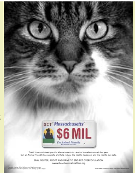
Poster (another one features a dog).

To receive a supply of flyers or posters, or to order a t-shirt, please email macadm@massanimalcoalition.org