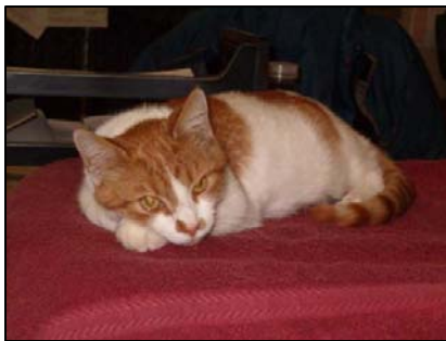
Johnny was hit by a car and brought to the Stoughton Animal Shelter where he was never claimed by his original owners. After 10 days he was neutered and adopted to a GREAT family and is now named Frankie and still living in Stoughton, MA!