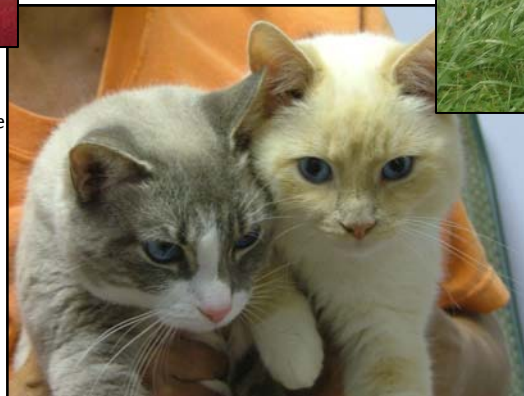
Clarence and Snowball , Siamese mix half-brothers, 3 and 2 years old, were rescued by MassPAWS and neutered with grant monies received from the "I'm Animal; Friendly" License Plate program.

Along with 18 other cats from one North Shore home, these two handsome and charming boys received appropriate veterinary care, including neutering, were placed in foster care, and were adopted.