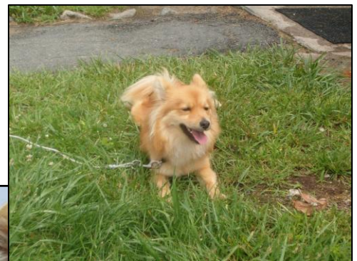
Merlin was dumped on the side of the road in Stoughton, MA. After 10 days he was neutered and adopted to a wonderful family and now resides in North Attleboro, MA.